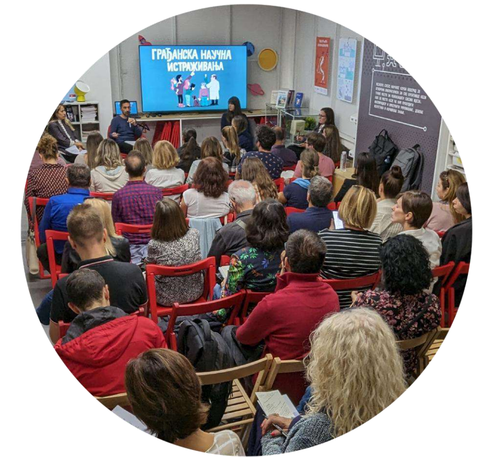
Info day at Science Club Belgrade