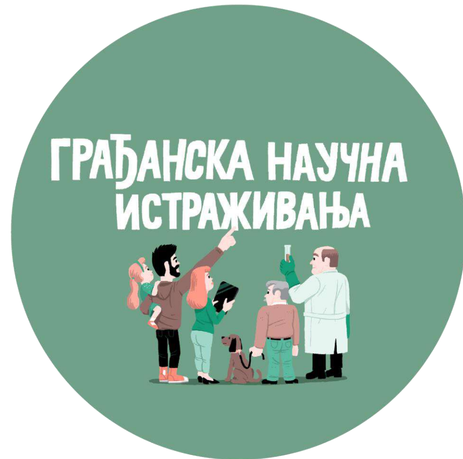
Citizen Science Guide